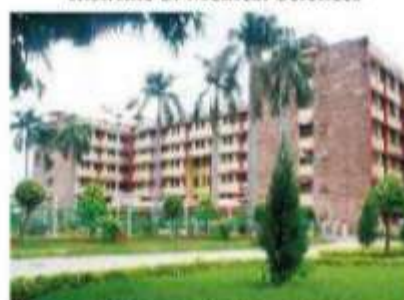
Sir Sunderlal Hospital