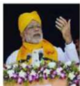
98 th Convocation – 2016 Hon'ble Prime Minister of India Shri Narendra Damodar Das Modi