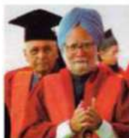
90 th Convocation – 2008 Hon'ble Prime Minister of India Dr. Manmohan Singh