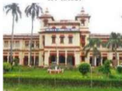
Institute of Agricultural Sciences