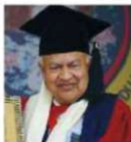
96 th Convocation – 2014 Padma Vibhushan Prof. Jayant Vishnu Narlikar