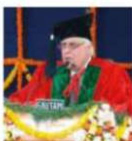
93 rd Convocation – 2011 Hon'ble Minister of HRD Shri Kapil Sibal