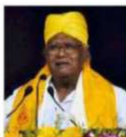
99 th Convocation – 2017 Bharat Ratna Prof. C.N.R. Rao, FRS