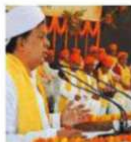
97 th Convocation – 2015 Padma Vibhushan Dr. G. Madhavan Nair