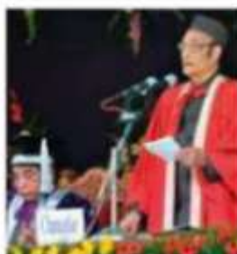
95 th Convocation – 2013 Hon'ble Chancellor of BHU Dr. Karan Singh