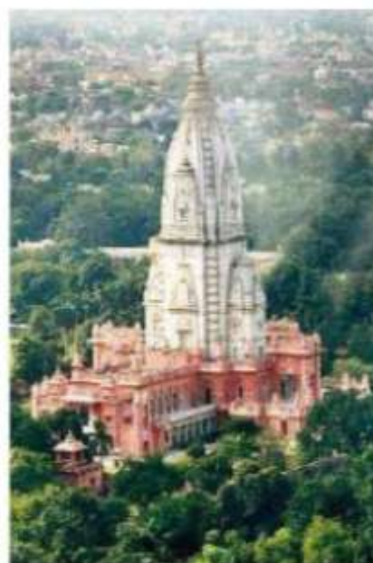
Shri Vishwanath Temple

BHU is the first Central University in India which has implemented a 'Graphic Identity Programme'. Through this programme, BHU has standardized its seal, logo, bilingual logotypes, tagline, colour identity etc. This programme also includes standardization of office stationery and signage system of the campus through its Design Studio, Souvenir shop, Electronic, Web & Social media.