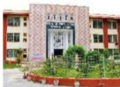
Institute of Medical Sciences