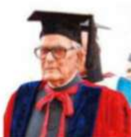
89 th Convocation – 2007 Hon'ble Vice-President of India Shri Bhairon Singh Shekhawat