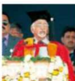
92 nd Convocation – 2010 Hon'ble Vice-President of India Shri Hamid Ansari