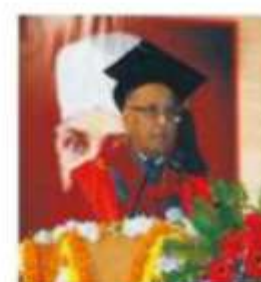
Special Convocation – 2012 Hon'ble President of India Shri Pranab Mukherjee