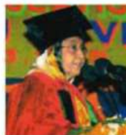
91 st Convocation – 2009 Hon'ble President of India Smt. Pratibha Devi Singh Patil