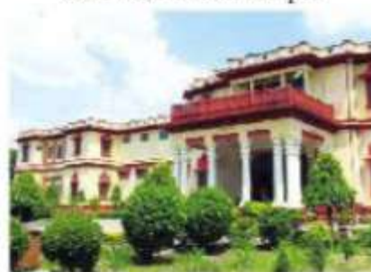
Bharat Kala Bhawan