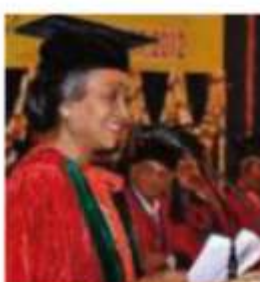
94 th Convocation – 2012 Hon'ble Speaker of Lok Sabha Smt. Meira Kumar