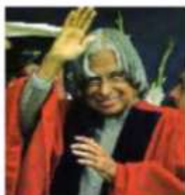
88 th Convocation – 2006 Hon'ble President of India Dr. APJ Abdul Kalam