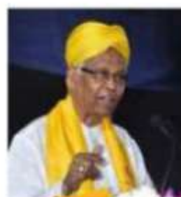
100 th Convocation – 2018 Padma Vibhushan Dr. Raghunath Anant Mashelkar, FRS